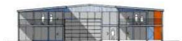
FRONT ELEVATION 1:1000