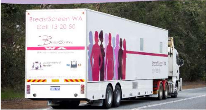
The BreastScreen WA mobile service will be at: Goomalling Goomalling District Hospital, Forrest Street

Women 50 years or over, have a FREE breast screening mammogram every two years. Once is not enough.