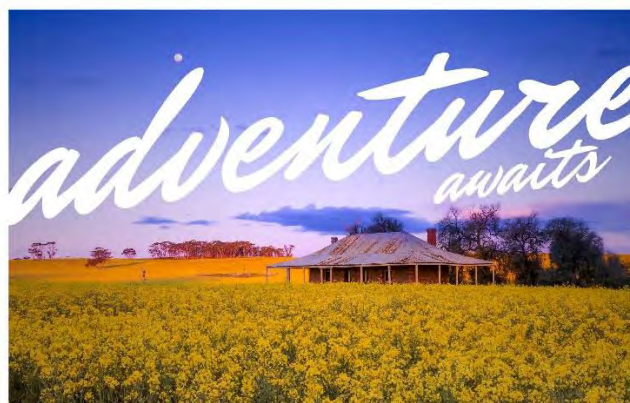
JUROKINE COACH HOUSE | GOOMALLING | FROM WHERE I AM