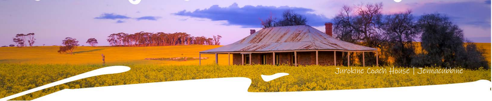
Jurokine Coach House | Jennacubbine