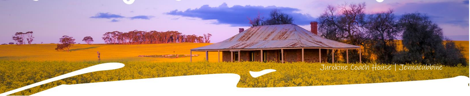
Jurokine Coach House | Jennacubbine

“When you make a choice, you change the future” - Deepak Chopra