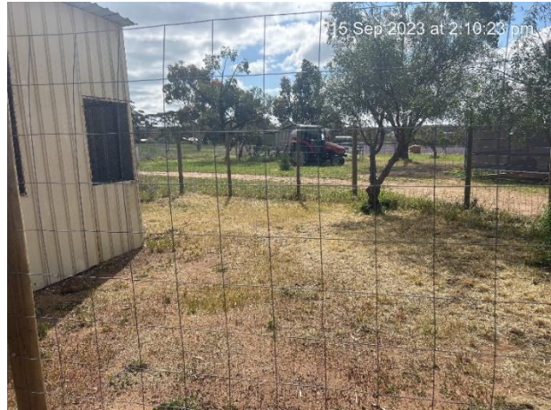
Yard attached to enclosure