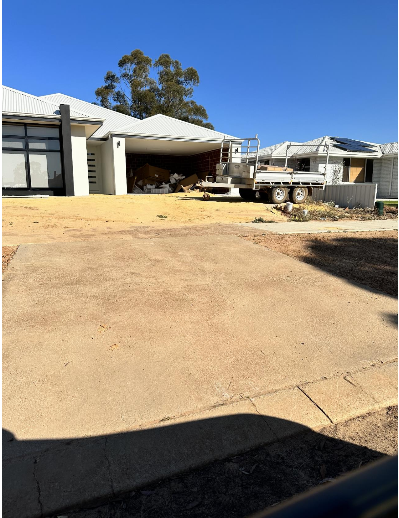
Figure 1: Existing crossover