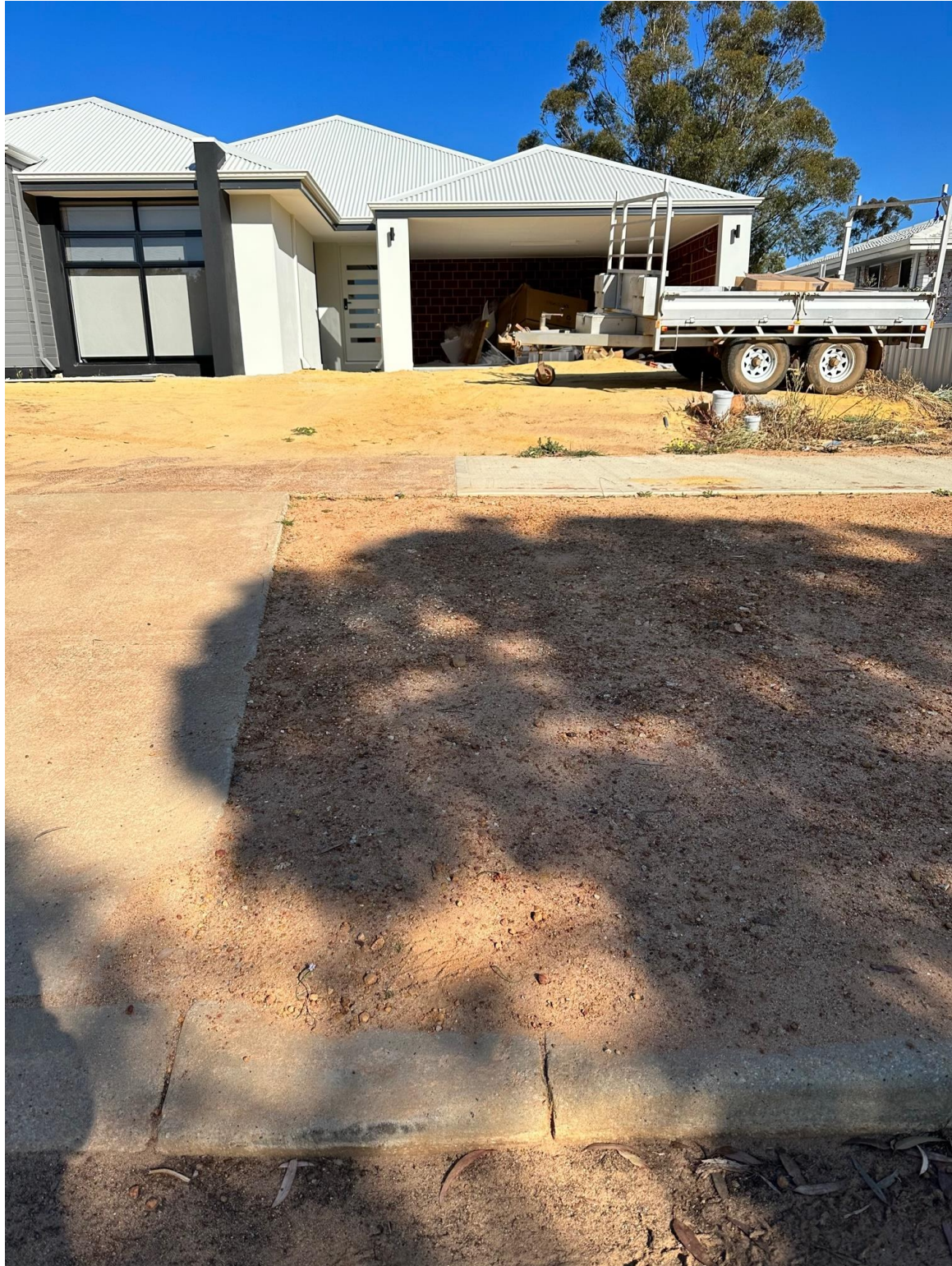
Figure 2: Existing Crossover showing alignment with garage