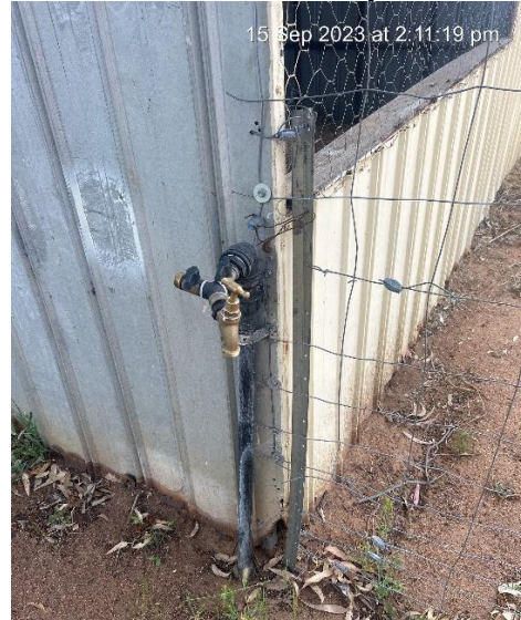
Water source for yard