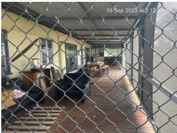
Enclosed Patio area house 1