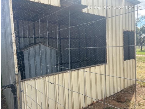
Enclosed dog yard 1