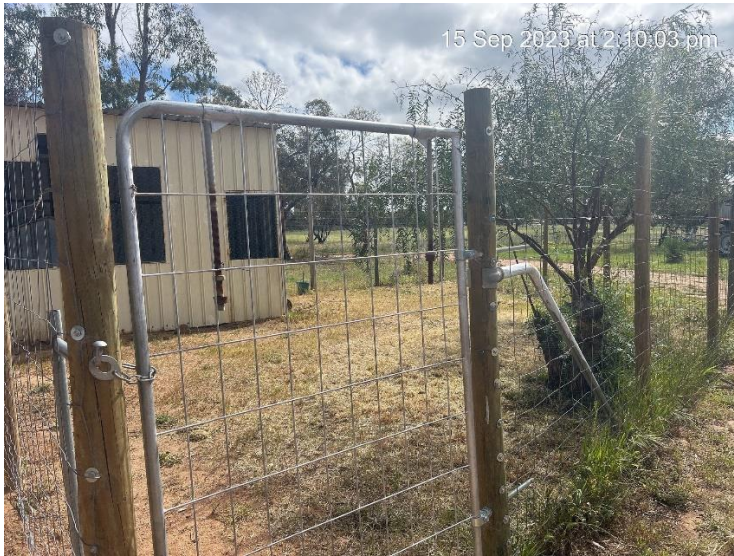
Gate and latch for yard 1