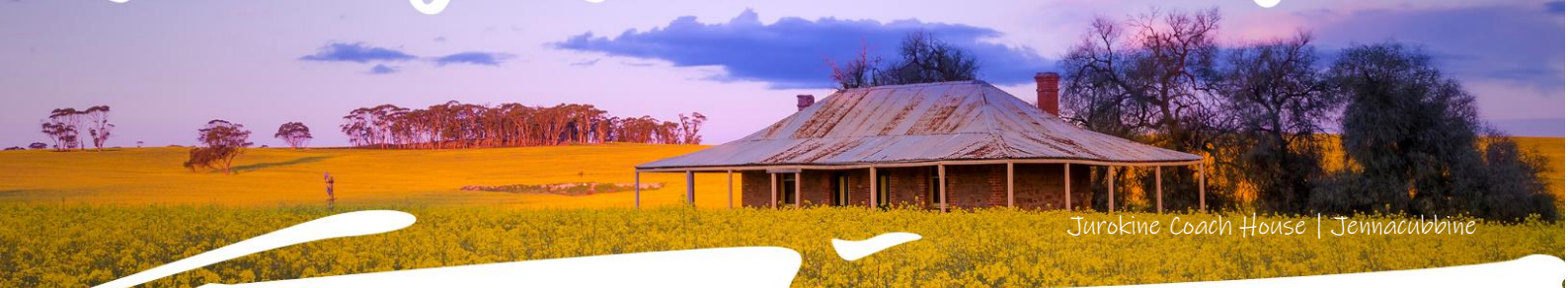
Jurokine Coach House | Jennacubbine

"If you want to go fast, go alone, if you want to go far, go together"