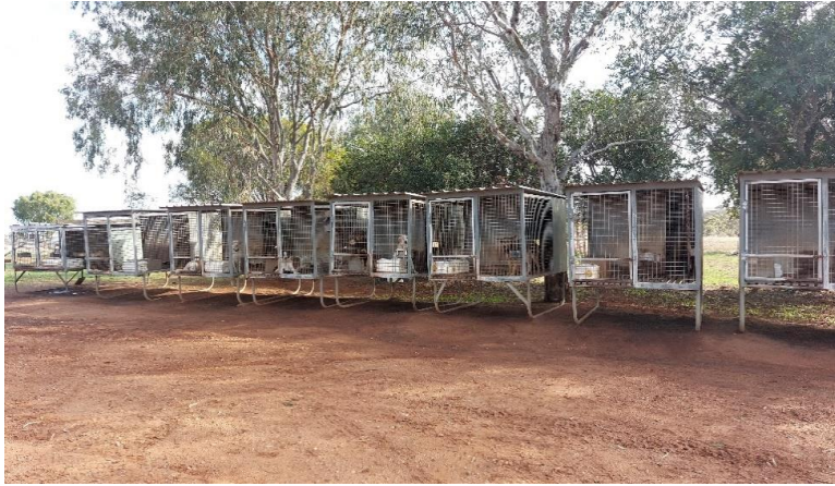
Existing Housing – 05/06/24

dogs are well stimulated and well nourished. The dogs are so well trained they do not need to bark for stimulation. The dog area was well maintained and clean of any faeces. I noted minimal flies and no smell present. The applicant is an active Educator in Working Dog Clinics all across Australia, as well as the Midwest and York and Northam.