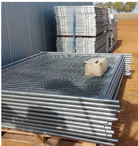
Kennel Materials 06/06/24