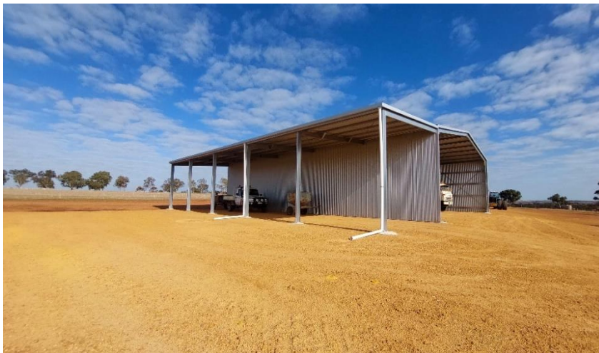
Kennel Location – 05/06/24