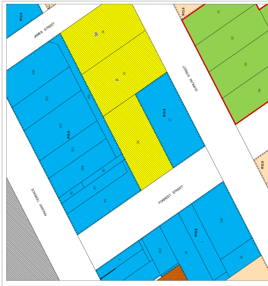
EXISTING SCHEME MAP