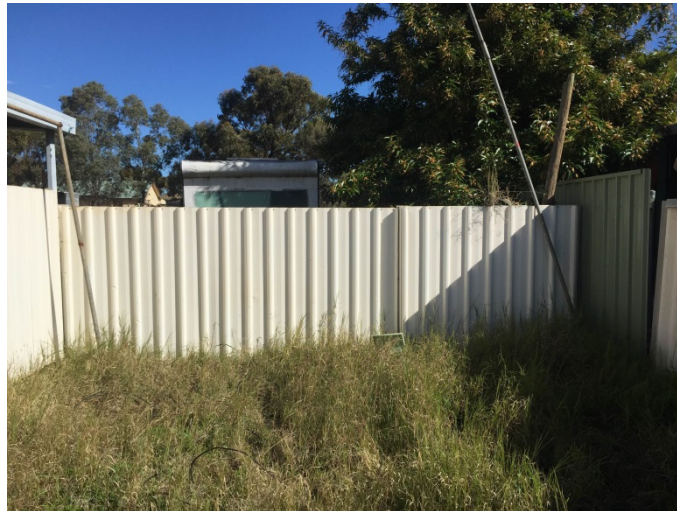
fence between front and back yard.