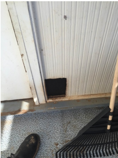
Cat door secured