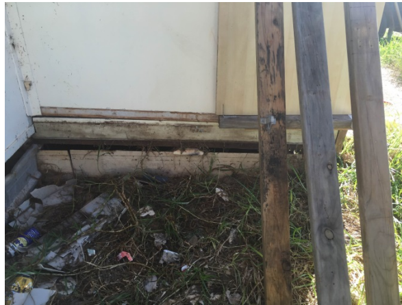
timber used to block of under the house