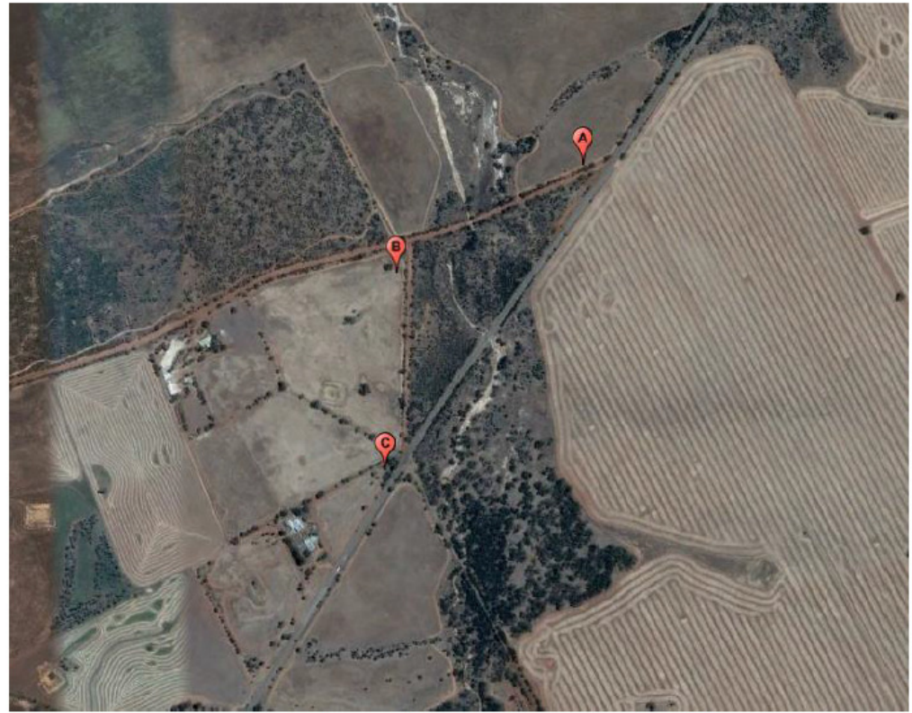
Figure 1 – Telstra Candidate Sites

The below map is an extract from Appendix No. 1, Planning Assessment Report.