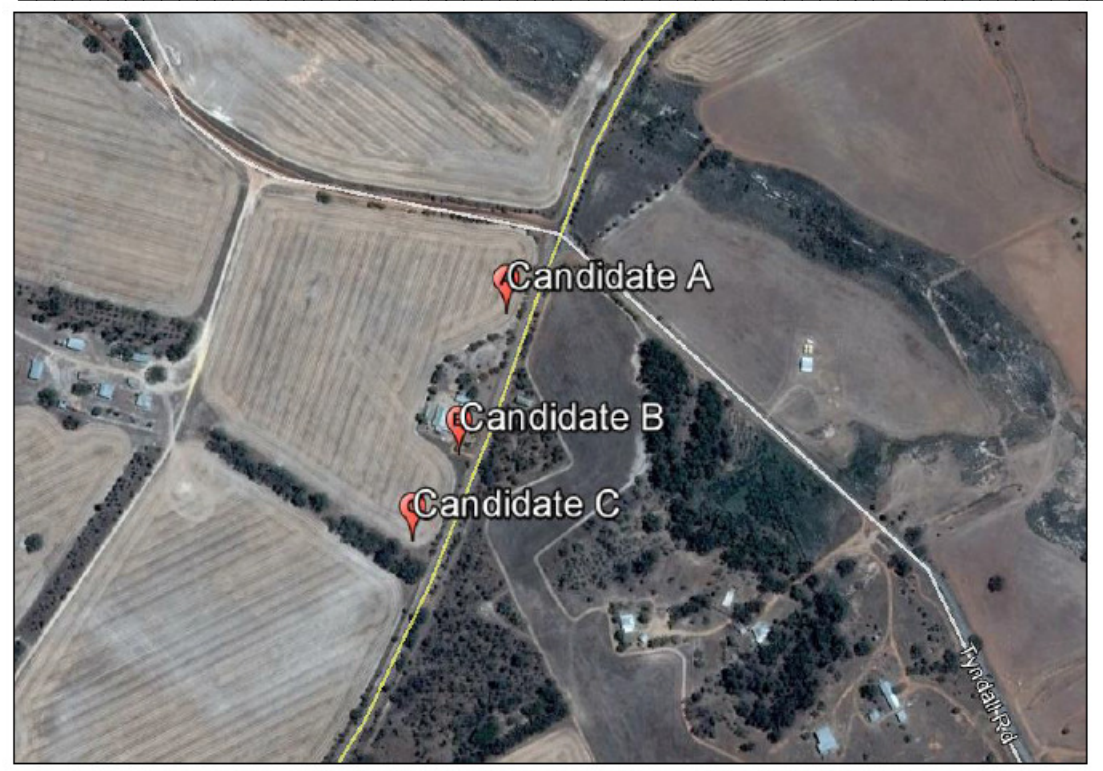
Figure 1 - Telstra Candidate Sites

A summary of the proposed candidates is located below, including a description of the opportunities and constraints that each site afforded.